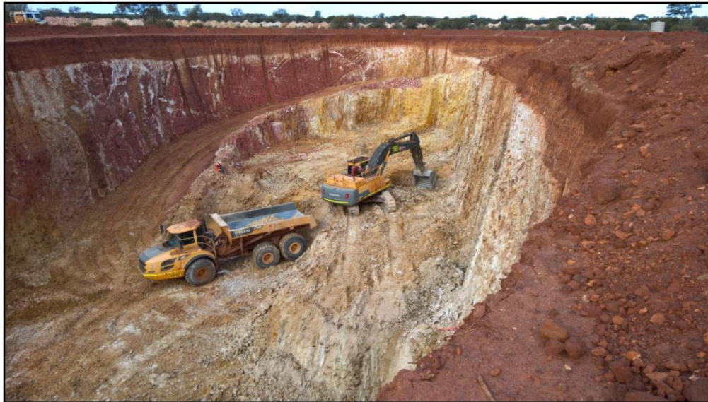
Figure 1: Trial Mining in 2016 at royalty-linked Lewis Deposit

The acquired royalty, previously produced on a bulk sampling basis, is a 1% Gross Value of Sales royalty above 10,000oz cumulative gold production (~9,100oz remaining hurdle) on mining lease M37/86, which is operated by Kin Mining Ltd (ASX: KIN) (“Kin”), and is part of Kin’s flagship Cardinia Gold Project, which is located 30km east of Leonora in Western Australia (the “Cardinia Royalty”). The Cardinia Royalty was created in 1993 pursuant to an Option Agreement between Sons of Gwalia Ltd and Centenary International Mining Ltd, the latter of which became CIM Resources Ltd, and eventually, Gloucester.